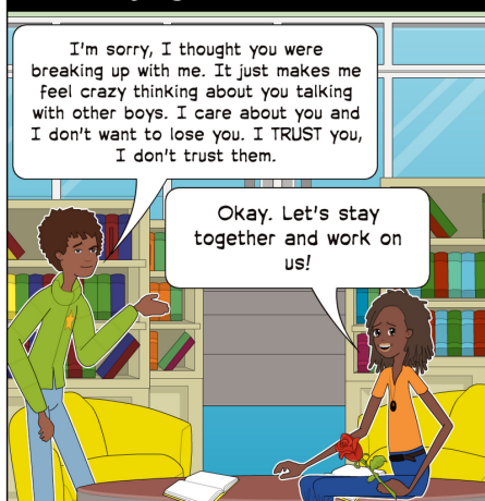
They agree to work on it