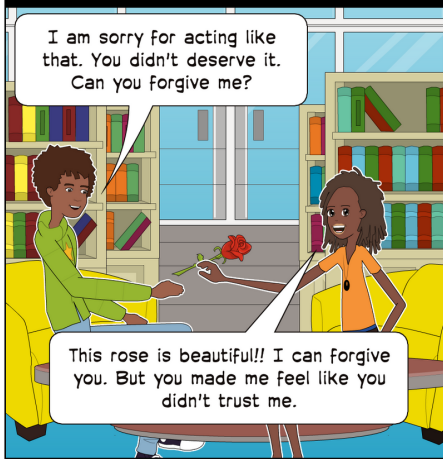
The conversation begins well